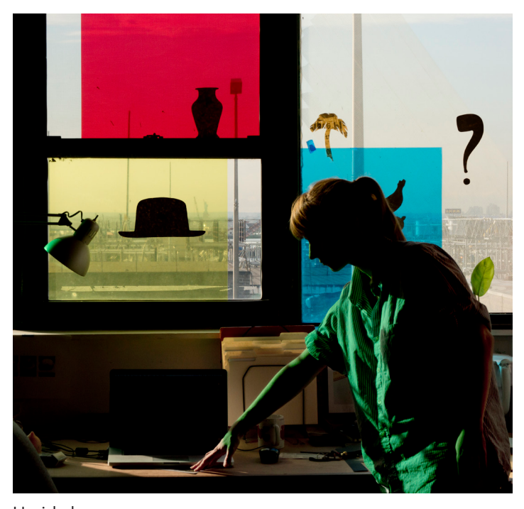
Untitled, 2012 Inkjet print 75×78 cm

In a tongue-in-cheek homage to René Magritte's famous painting "La Trahision des Images" (The Treachery of Images) from 1929, which depicts a pipe but with the clarifying description "This is not a pipe," Kathrin Sonntag's exhibition repeatedly displays the motif of a pipe alongside a banana, a hat, and scissors. In a variant turned by 90 degrees as a silhouette on the gallery window and in an optical interplay with a large "spot" on the gallery floor, the form of the pipe becomes a question mark. Behind it one sees the photograph of a pine tree shot on the American prison island of Alcatraz, whose silhouette enters into a dialog with the spot and, as a "shadow of reality," develops an "exit strategy" from the image (or reality?). The "magical moment," which photographers often describe as the moment in the dark room when the motif becomes visible, is exposed in Kathrin Sonntag's photograph "Untitled" "before they eyes" of the viewer, so to speak. Doubled by the motif of the "artist in the studio," the "magical place" of artistic creativity, a mysterious atmosphere emerges against the objective character of the photograph with subtle references to the light and shadow painting of Jan Vermeer's self-portrait "The Art of Painting." The