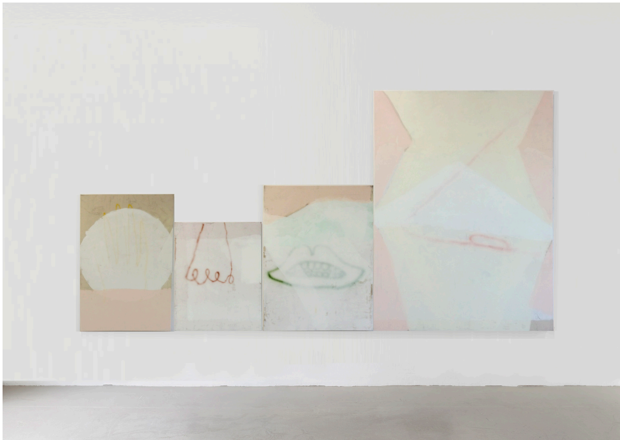
Sie trank Wasser aus dem Millstätter See , 2015 varnish and spraypaint on canvas, 200 × 405 cm