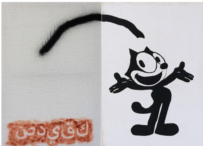
your friend #2 , 2015 varnish and spraypaint on canvas 95 x 130 cm

entanglements of world politics. Since 1948, Felix The Cat has been continuously used by the US Army as a symbol for various military maneuvers. The painting "Fliehender Tisch und Fatale Architektur" ["Fleeing Table and Fatal Architecture"] is an encoded homage to his parental home, and "Das Auge der Katze" ["The Eye of the Cat"] or "Die Sanfte" ["The Soft One"] unsuspectingly leads the viewer to the psychological depths of Georges Bataille's "Story of the Eye". Malte Zenses' sculptures continue this quite natural dissolution of familiar formal boundaries; they can be described from several perspectives as a "dance around one's center", both in a personal respect and in regard to the identity as an artist. The neon lettering "#gal" displays a hashtag from the Ragga dance scene that uses "gal" as a playful word, vacillating between respect and snideness, for a "girl" who can dance well. In a complex manner, Malte Zenses' works play with the déjà vu of familiar things and allow the view to "enter the image" via formal and autobiographic codifications. Malte Zense's works become secret friends of the viewer individually forming a message.