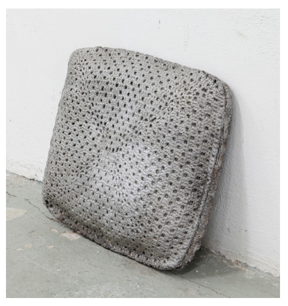
Jürgen Drescher <u>Cushion (centered)</u>, 2011 aluminium sand <u>casting</u> 35 × 40,5 × 5,5 cm

Jürgen Drescher's work is characterized by objects of daily use. His first well-known works such as DRESCHER Bar (1981), Zu groß für über's Sofa (1984) or Foyer (1985) were sculptural and installative arrangements of found and worn materials in the sense of ready-mades. In the work process of ironic-subtle observation, these initial pieces already form a sort of limbo between reality and its model as a frame for possible actions. Jürgen Drescher's recent works such as Kiste (2008-2014), Cushion (centred), 2011, or Yorgan II, 2012, focus on mundane objects. However, they are no longer originals as part of an arrangement, but become reproductions of themselves through the elaborate process of aluminum casting. The works thus elude the notion of the ready-made and also of their original design and functionality.