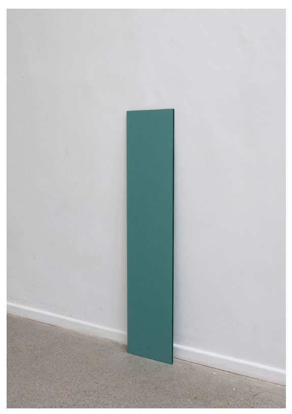
Vajiko Chachkhiani, <u>Two Portraits of</u> the Same Person (who is not the same anymore), 2014 two mirrors 153 × 35 × 1,5 cm

alludes to Andy Warhol's film Sleep from 1963. Whereas Warhol "stages" the voyeuristic gaze of the spectator, Chachkhiani develops a personal and allegorical poem dedicated to the cycle of life and death.