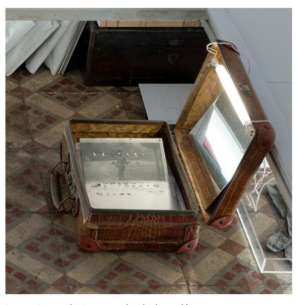
Laura Lamiel L'espace du dedans (1), 2014 leather briefcase, enameles silkscreened steel, mirror, paper, neon light 28 × 26 × 25 cm

Laura Lamiel's sculptural and photographic scenographies superimpose different spatial and narrative structures. Originally trained to become a painter, she has been transferring pictorial arrangements to space since the late 1980s. Here, she confronts minimalistic elements such as white enameled metal panels or neon tubes with found everyday objects and objects from her studio. Lamiel describes the superimposition of different spatial and object constellations, like transferring experimental studio situations to the gallery space or the confrontation between strictly rational forms and intuitive elements, as "formal shock". This repeatedly leads to repositioning one's own gaze and questioning the status of the work that one sees or in which one is literally situated with Lamiel.