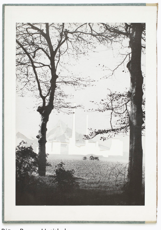
Björn Braun, <u>Untitled</u>, 2014 collage on book cover 33 × 23,5 cm

The two-part object Untitled is made of two deconstructed chairs. The seats and backs of a black and a white plastic chair were dismantled and then reassembled to a new "seat", while the other parts were merged to an object-like "abstract painting". The two chairs are relieved of their actual function of providing a seat and in their reconstructed form become a "picture to look at" that in an ironic and subtle way starts to tell stories about the cultures of everyday life and idleness.