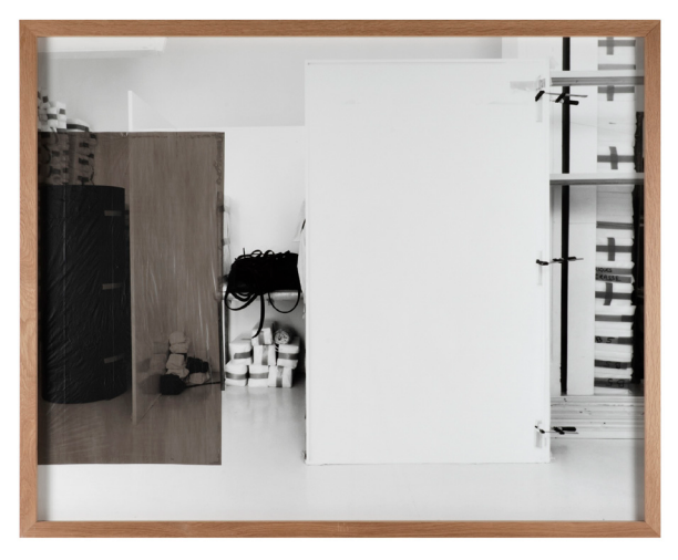
Laura Lamiel <u>Untitled</u>, 2000 baryta print with added plastic 126×157×4 cm

Her early photograph <u>Untitled</u> documents a real working situation in her studio that can simultaneously be the fictive "image" of an artist's studio as a model-like arrangement in front of the camera, and through the application of a foil on the picture medium also becomes an object. The two objects <u>L'espace du dedans (Innerer Raum) 1</u> and <u>2</u> combine Lamiel's signature elements, neon tubes, minimal surfaces and photographs, in the narrowly defined space of two found suitcases. As a kind of "scene within a scene", they reveal the beginning of numerous narrations of everyday life, the artist and ourselves.