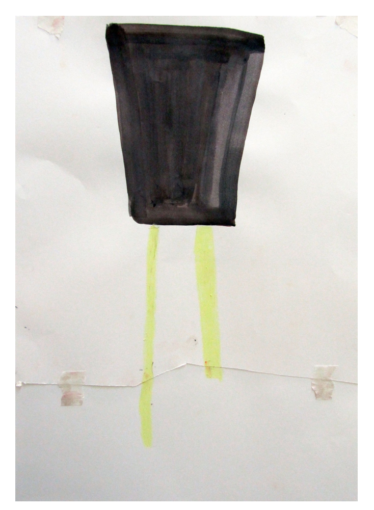
Untitled, 2014 watercolor, wax crayons, crepe, 40 × 29,5 cm

The artist's sculptures and works on paper are created in relation to each other and consistently interact. Questions specifically related to the space are included in this interplay and are crucial for presenting the works The modular treatment of the sculpture plays a central role: The arrangement and expansion of the concrete slats and the plaster flakes stacked on them are variable and adapted to the gallery space.