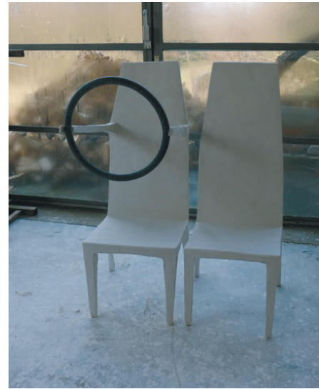
Auto (Car) , 2016 plaster on iron construction, overall dimension approx. 113×120×55 cm

Comedy and tragedy lie close to each other in Mahn's oeuvre, like in real life. The artist sees her sculptures as "stops" in between; contradictions are not disturbances but complements. In Inge Mahn's words: "I create an order to understand, or rather: I try to grasp the order that lies behind things. I want to know what the interrelations are and experience orders that I only assume. The orders that contradict our agreements or suspend them, yet that function together with each other."