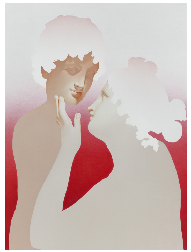
Ode, 2019 oil and acrylic on canvas 150×110 cm